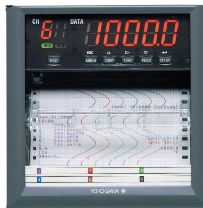
SR10000 (6 dot model)

The SR10000 can be used as a monitoring device and as a quality control instrument in many applications (such as process temperature monitoring, pollution, construction, furnaces, field of medical diagnosis, field of refrigerating, etc.).